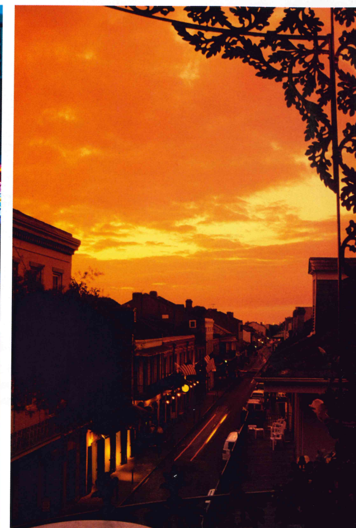
TOP LEFT: Beale Street, Memphis, TN ABOVE: French Quarter, New Orleans, LA LEFT: Museum of Science and Industry, Chicago, IL BELOW: Pearl River Bridge, LA